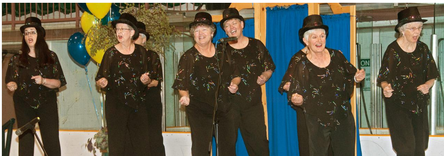
A lyrical group of happy PROBUS members laughing it up at their Spring Fling celebration

PROBUS GET CONNECTED – STAY CONNECTED BE A FRIEND – BRING A FRIEND A happy and safe summer to all!!